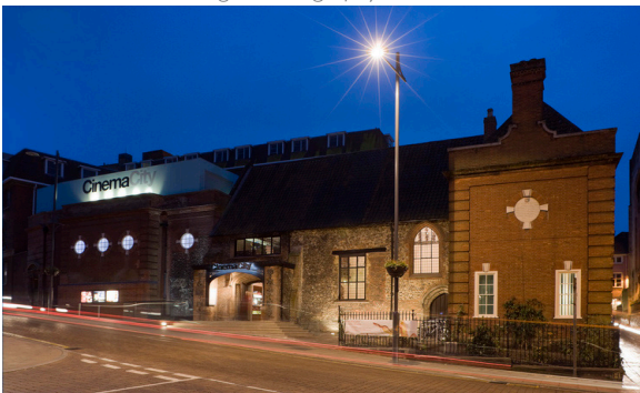
Norwich Cinema City