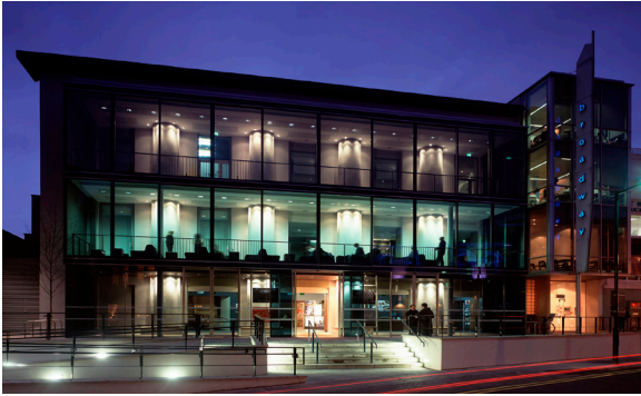
Broadway, Nottingham