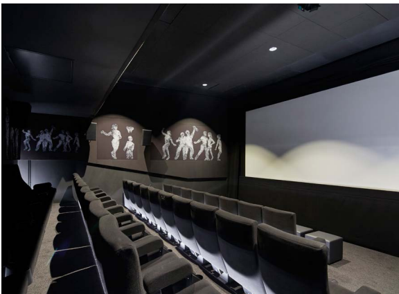
Depot Lewes, Screen 3