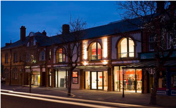
Scala Cinema