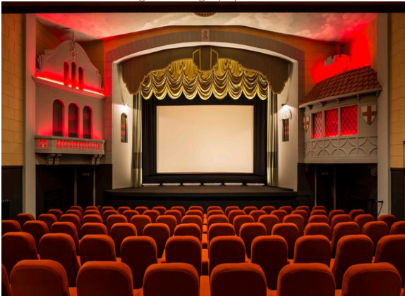
Campbelltown Picture House - Screen 1