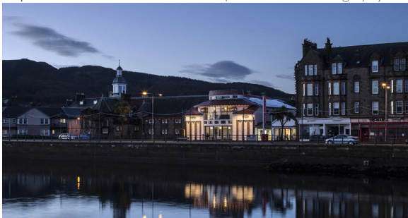
Campbelltown Picture House