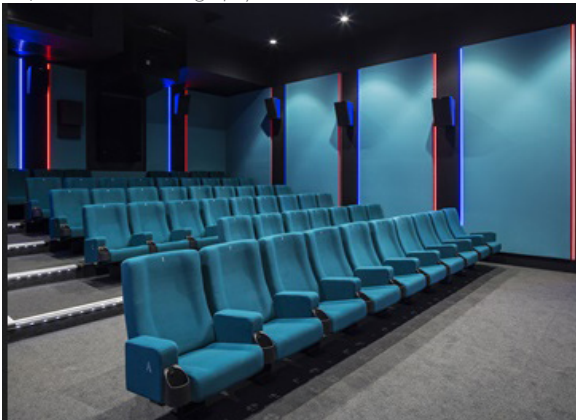
Campbelltown Picture House - Screen 2