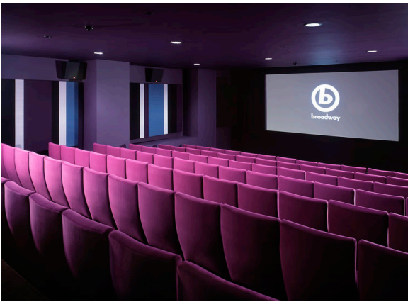
Broadway, Nottingham's Media Centre - Screen 3