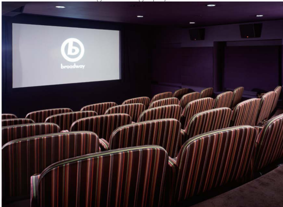
Broadway, Nottingham's Media Centre - Paul Smith Screen