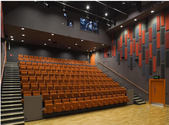
Scala Cinema and Arts Centre, Prestatyn

MA Dip Arch (Cantab) RIBA FRSA, Principal of Burrell Foley Fischer LLP 1985-2015, Consultant to Burrell Foley Fischer LLP 2015 - 2020, Consultant to Philip Meadowcroft Architects 2019 - current.